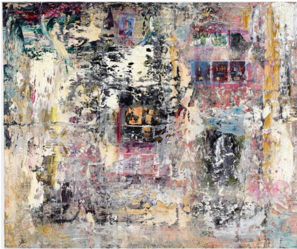
Untitled II (Srik Series) © John Kingerlee 16 panels each 24x24 inches