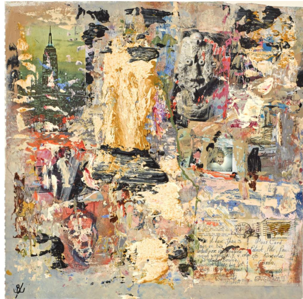
THOSE EARLY DAYS IN CORNWALL (SRIK SERIES)