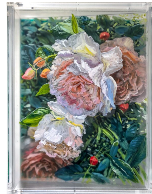
MARTIN WEINSTEIN Climbing Rose, 2 Evenings, 2010

14 x 11.5 x 1 inch (h x w x d) Acrylic on multiple acrylic sheets